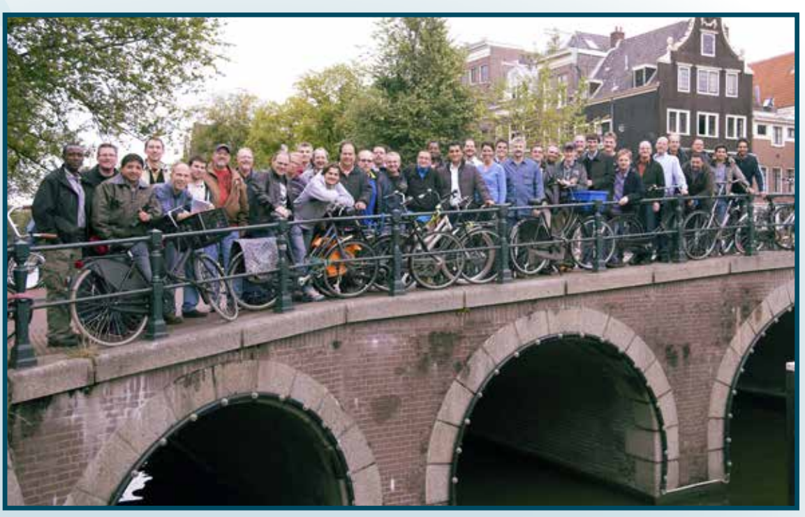
Pastors/Leaders from Europe at GCE pastors' summit in Amsterdam (September 2013)

With this new push forward, we are looking forward to seeing God's hand at work.