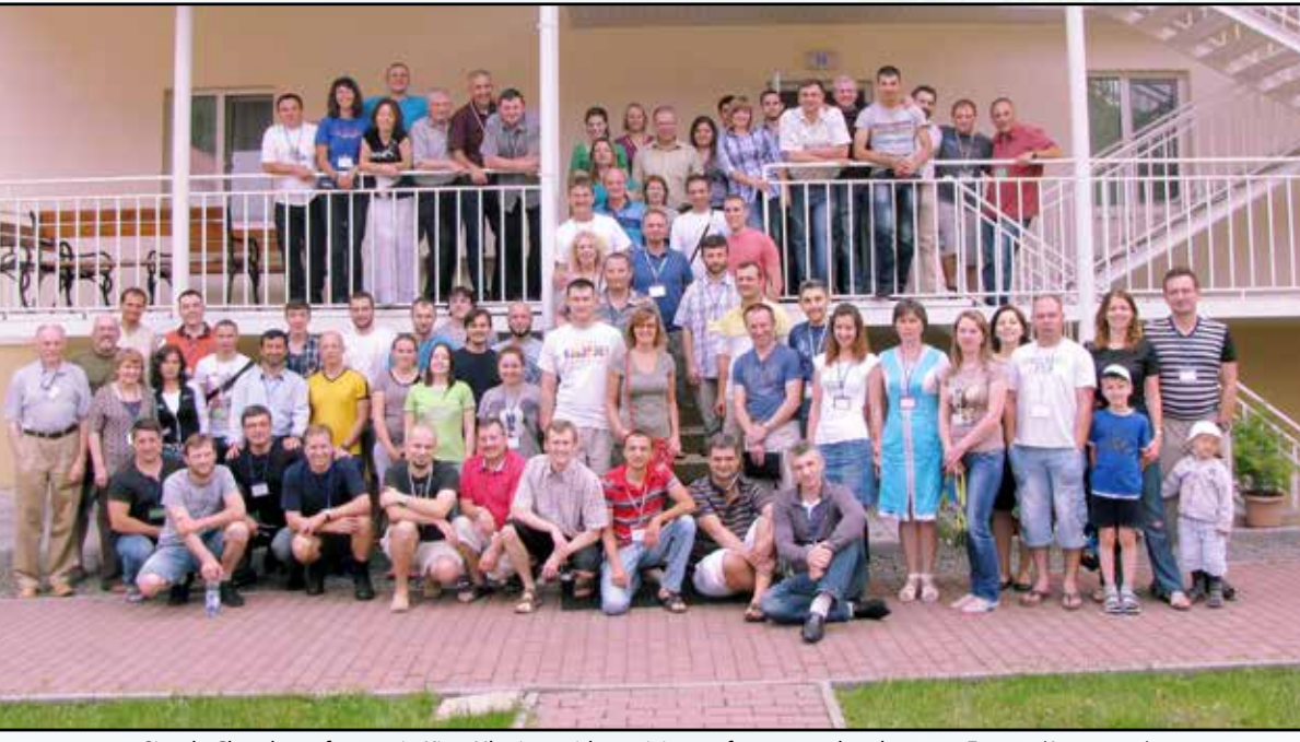
Simple Church conference in Kiev, Ukraine, with participants from central and eastern Europe (June 2013)